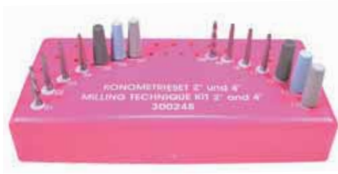
KONOMETRIESET 2° und 4° MILLING TECHNIQUE KIT 2° und 4°