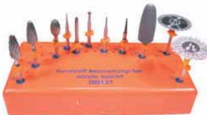
KUNSTSTOFF BEARBEITUNGSSET ACRYLICS TOOL-KIT