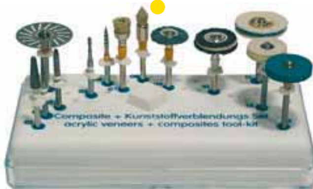
KOMPOSIT + KUNSTSTOFFVERBLENDUNGSSET TOUGH ACRYLIC VENEERS + COMPOSITES TOOL-KIT