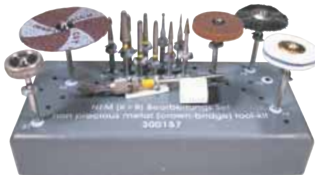
NEM (K+B) BEARBEITUNGSSET NON PRECIOUS METALS (CROWN-BRIDGE) TOOL-KIT