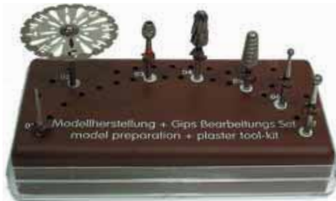
MODELLHERSTELLUNG + GIPS BEARBEITUNGSSET MODEL PREPARATION + PLASTER TOOL-KIT