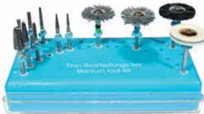
TITAN BEARBEITUNGSSET TITANIUM TOOL-KIT