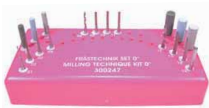
FRÄSTECHNIK SET 0° MILLING TECHNIQUE KIT 0°