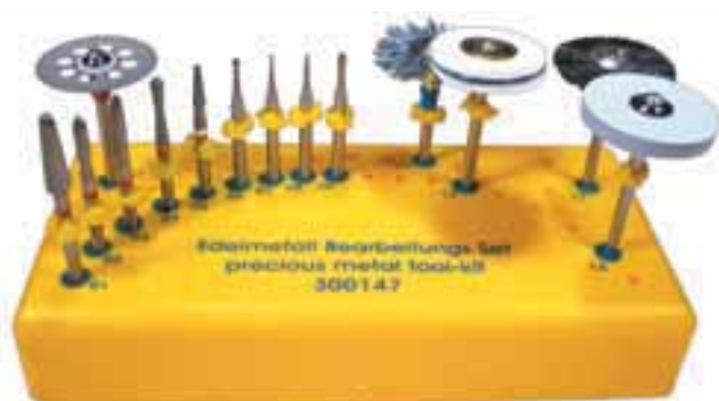
EDELMETALL (K+B) BEARBEITUNGSSET PRECIOUS METALS (CROWN+BRIDGE) TOOL-KIT